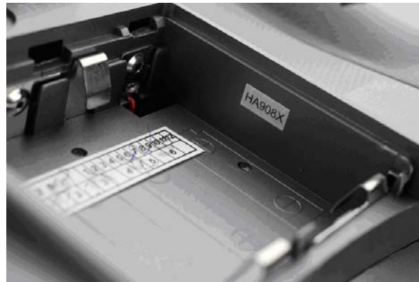
PID within the battery compartment

Product Identification (PID) code may be found on the inside of the battery compartment of the DX6i transmitter.